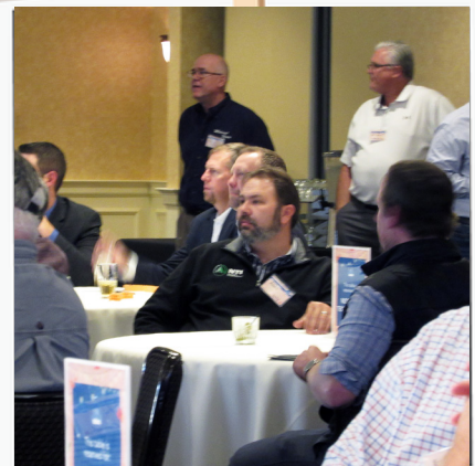
Attendees listen to event speakers